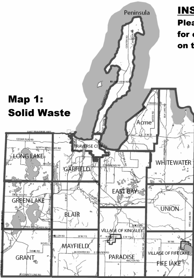
Map 1: Solid Waste