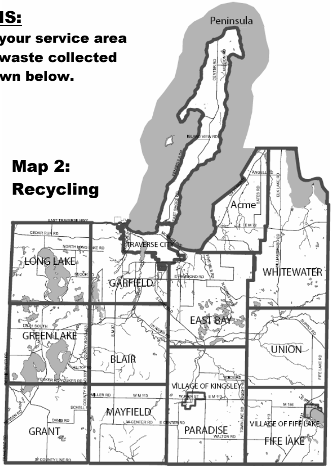
Map 2: Recycling