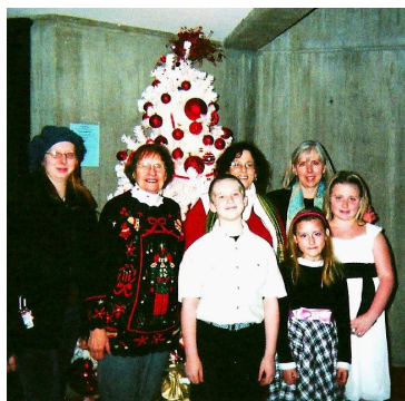
Learning Partners enjoy The Nutcracker ballet at Interlochen in December 2011