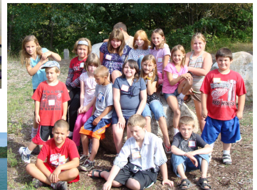
Learning Partners Hike and Picnic summer 2011 and Learning Partners fishing outing 2011