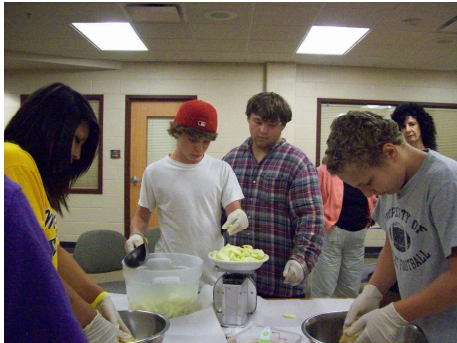
New Vision Youth make apple pies courtesy of the Grand Traverse Pie Company.