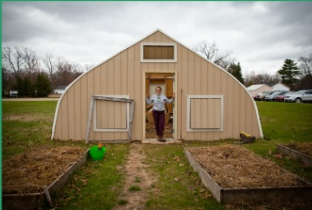
Traverse Heights Elementary Greenhouse

Delivery of hands-on nutrition and food systems education