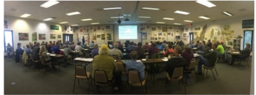
Integrated Pest Management Update Meetings