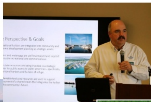
11th Annual Freshwater Summit