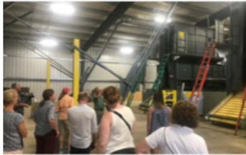
Hops Production Education