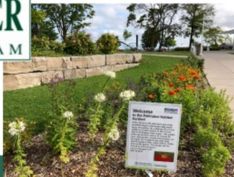
Pollinator Garden at Clinch Park